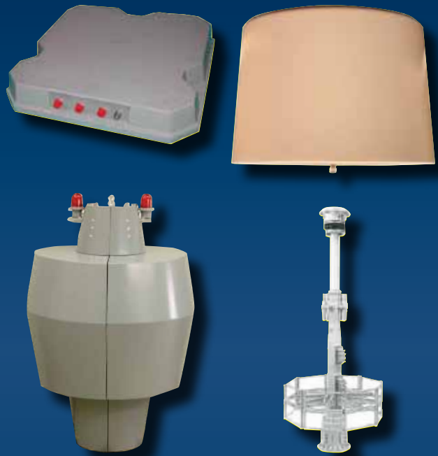
Representative sampling of compatible antennas